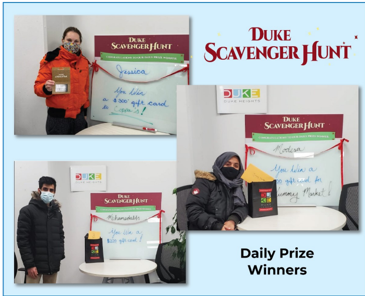
Daily Prize Winners

There is still time to join the Duke Scavenger Hunt. Participants can register on the GooseChase app (download: http://t.ly/H1gW ) and using our unique code 6769J4 . Everyday one top participant will be eligible to win a prize valued at $300 composed of products and/or services from one of the Duke Heights BIA businesses. At the end of the 21 day Duke Scavenger Hunt, the top 3 contestants will be awarded one of three grand prizes. Follow the link below for further information and details.