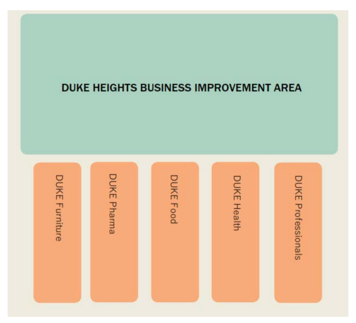
Figure 1. DUKE Sub-Brand Architecture

A sub-brand architecture will be used, presenting DUKE Food under the greater DUKE brand. This allows the food sector to take advantage of the work that has been done on the DUKE brand, which includes DUKE Perks, DUKE News, DUKE Talks: