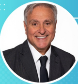
ANTHONY PERRUZZA CITY COUNCILLOR WARD 7 - HUMBER RIVER—BLACK CREEK